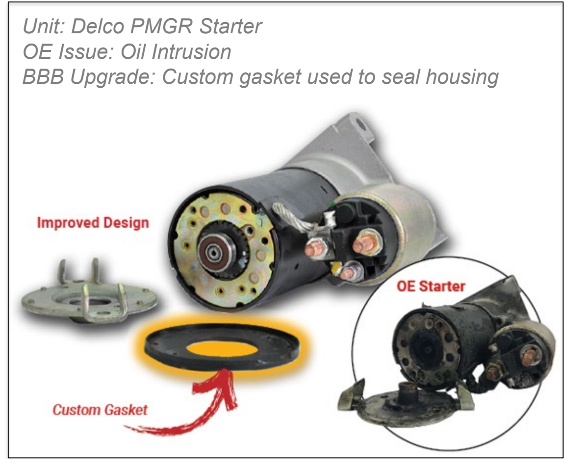
Unit: Delco PMGR Starter OE Issue: Oil Intrusion BBB Upgrade: Custom gasket used to seal housing